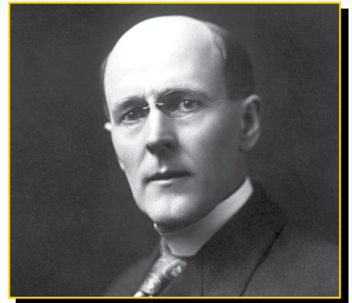
Founder of Rotary International Paul P. Harris

On April 11, 1924 – a small group of Bowmanville businessmen formed the Rotary Club of Bowmanville. Thus began our 90 year legacy of building communities and helping individuals both locally and around the world.